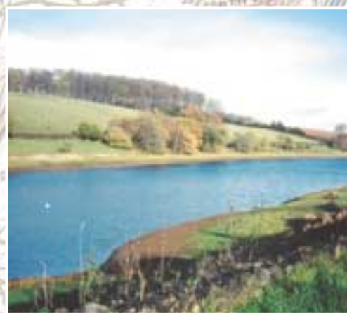
14 - Hawkridge Reservoir